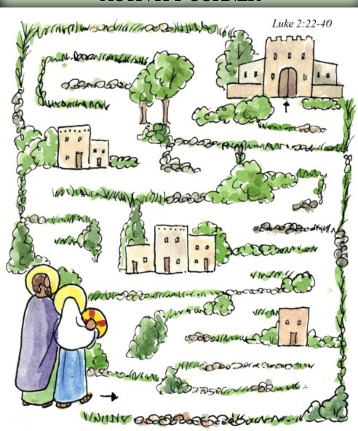
Can you help the Holy Family find their way to the Temple so that Baby Jesus can be presented there?