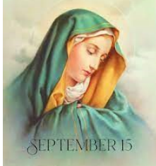
Feast of Our Lady of Sorrows

Please keep the CCD teachers, students of St Peter and St Joseph in your thoughts as they begin their academic year. I thank all the teachers for your generosity with time and sharing of faith. I hope the parents would make sure that the children attend CCD regularly.