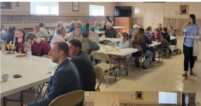
Breakfast last Sunday was enjoyed by many!