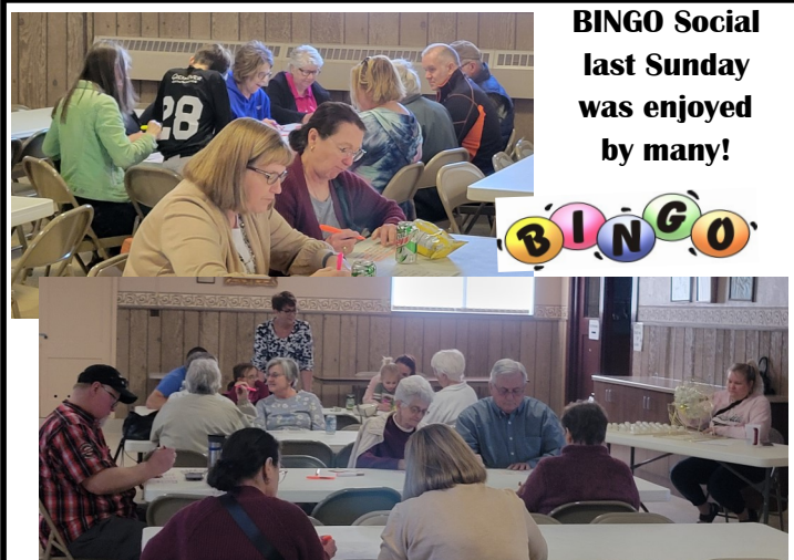
BINGO Social last Sunday was enjoyed by many!

On Sunday, April 28 (Noon) to move pews and furniture out and On Saturday, May 4th (10 a.m.) to move the pews and other furniture back in place. Many hands make light work! Hope to see you there!