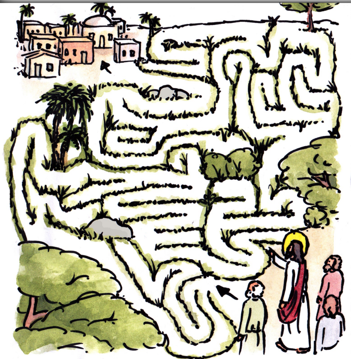
At the end of today's Gospel reading, Jesus tells Simon that they will go to the nearby villages to preach. Can you find your way through the maze to the nearby village?